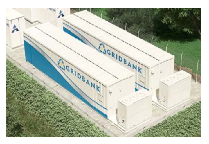
The Alevo GridBank, an advanced lithium-ion storage system.