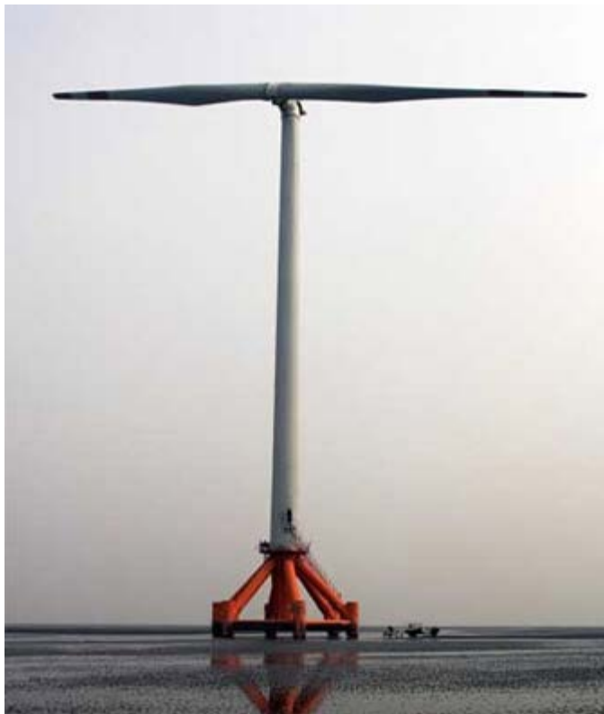
One of the Ming Yang's two-blade, energy-efficient wind turbines