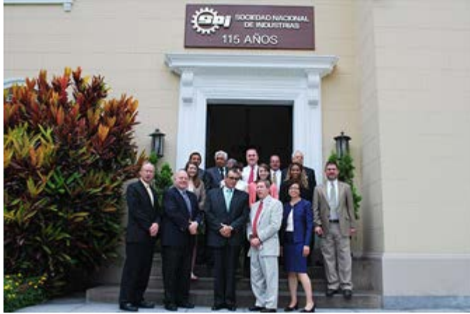
The N.C. delegation visiting the offices of the National Society of Industries in Peru