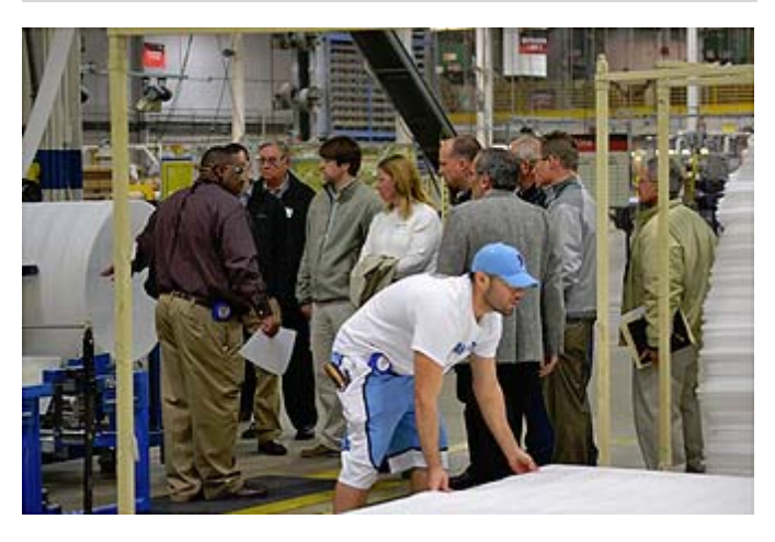
Members of the Manufacturing Makes It Real Network receive a tour of the Nomaco plant in Zebulon

The event is co-hosted by <u>The NanoBusiness</u> <u>Commercialization Association</u>, the <u>N.C. Department of Commerce's Office of Science and Technology</u> and the <u>Center of Innovation for Nanobiotechnology</u>. Early, discount <u>registration</u> and the <u>conference agenda</u> are available online.