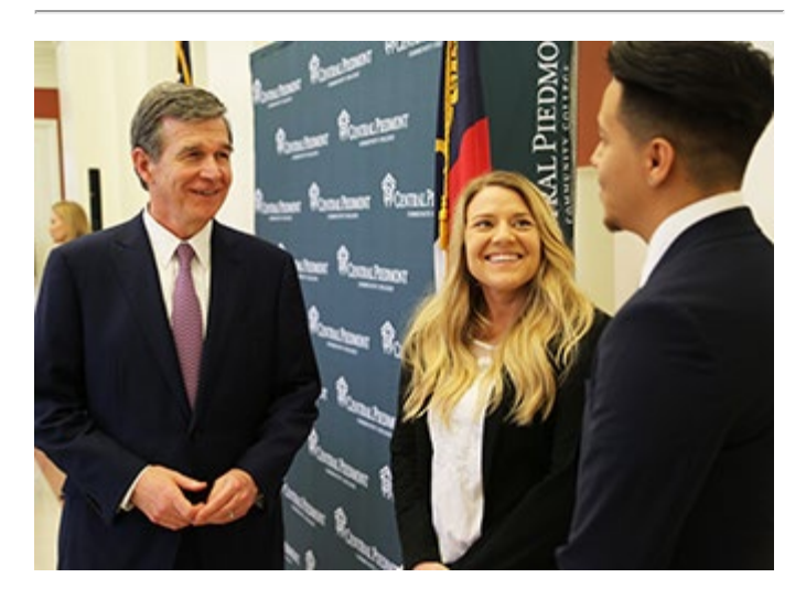
Governor Cooper at the January 14 event at Central Piedmont Community College.

Partnering with the <u>North Carolina Department of Commerce</u> and the <u>Economic Development Partnership of North Carolina</u> on this project were the <u>North Carolina General Assembly</u>, the <u>North Carolina Community College System</u>, the <u>North Carolina Biotechnology Center</u>, <u>Durham County</u>, the <u>Greater Durham Chamber of Commerce</u>, and <u>Duke Energy</u>.