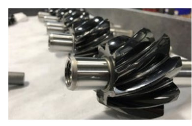
Gears to be protected with wear-resistant coatings.

United Protective Technologies, LLC is an industry leading company that develops advanced coatings to increase durability, increase component functionality and extend operation life to technologies used in extreme environments.