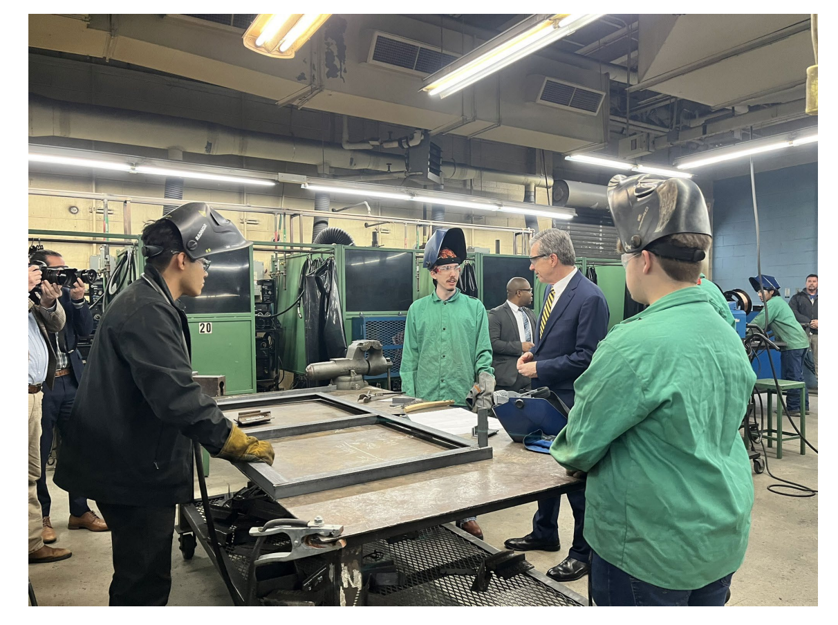
Caterpillar Pre-Apprenticeship Training in Welding, Central Carolina Community College