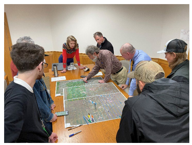
Local stakeholders in Jackson County, NC examine a map and discuss strategies to leverage outdoor recreation to increase economic opportunity.

ARC Community Economic Development Planners are facilitating economic development strategic planning focused on leveraging outdoor recreation to bolster local economic vitality. Strategy development focuses on utilizing the unique natural assets and recreational opportunities in a community to increase tourism, encourage small business development, enhance quality of life for residents, plan for asset and infrastructure development, and position communities to grow and attract outdoor gear manufacturing industries. In several communities across the region, this work is collaborating with and complimenting economic development activities