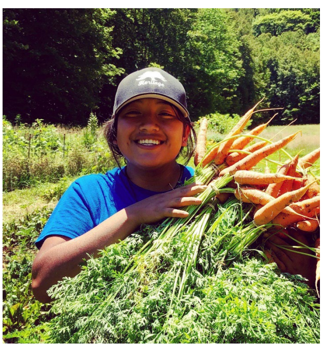
Dig In! Yancey Community Garden grows and shares produce from their gardens so that neighbors have access to fresh produce that is reliable and of the highest quality to increase food security.

ARC has initiated a new program, READY Appalachia, to help build community capacity by offering training and flexible funding to organizations in four key economic development pillars: nonprofits, community foundations, local governments, and Local Development Districts. As part of this program, READY Appalachia awarded $25,000 each to three NC non-profits: Dig In! Yancey Community Garden, RiverLink, Inc., and Haywood Christian Ministry, Inc. Prior to accessing this funding each organization participated in 10 weeks of intensive courses covering board development, financial management, fundraising, employee recruitment and retention, marketing communications, and programs and operations. The technical assistance and funding will strengthen these organizations and help them better serve their communities.