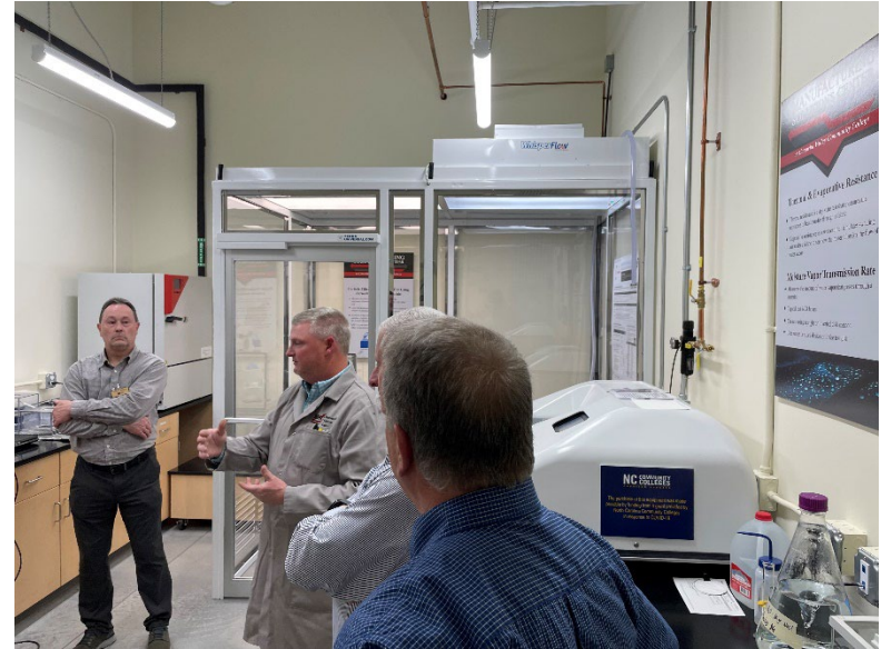
A Manufacturing Solutions Center employee explains the new equipment used to develop and test Personal Protective Equipment and other innovative products.

and increase efficiency to assist in the creation or retention of jobs in the manufacturing sector. MSC recently expanded their facility to allow for the testing and prototyping of fibers and fabrics needed to produce Personal Protective Equipment (PPE), along with other needed products in the wake of COVID-19 and the efforts to re-shore American textile production. This is an additional resource added to the organization's services that allow the MSC to assist businesses in testing, prototyping, and product development utilizing state-of-theart technologies to improve advanced manufacturing throughout the NC ARC region.