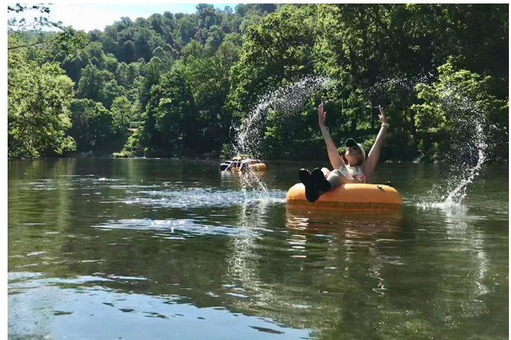
Toe River Tubing, Mitchell County, NC

The Mitchell County Chamber of Commerce and Mitchell County government engaged NC Appalachian Regional Commission (ARC) and Rural Planning program planners to facilitate a countywide strategic planning process focused on growing the local outdoor recreation economy. Through meetings that began in January 2021, the planners helped a local work group identify four primary activity areas for further development – walking and hiking, cycling, fishing, and floating (e.g., canoeing and rafting). Building on an existing outdoor asset mapping project by NCGrowth, the work group and planners analyzed outdoor recreation assets in the county, expanded on potential user experiences, and identified gaps in those experiences that presented business development opportunities. The work group completed, and county government adopted, the Mitchell County Outdoor Recreation Economy Strategic Plan in fall 2021.