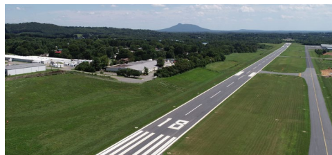
Mount Airy/Surry County Airport, Mount Airy, NC

In partnership with the N.C. Department of Transportation, Division of Aviation, and the Institute for Transportation Education and Research at North Carolina State University, the Rural Planning program began working with public airports on economic development strategic planning in 2021. The partners provide the airports with economic impact data, an inventory of existing facilities, an evaluation of infrastructure, capabilities, and services, as well as a facilitated strategic planning process. The process helps participants identify opportunities for operational and other improvements to enhance airports as economic assets, establish a vision for the future, and prepare a five-year plan with growth and development strategies. In 2021, the Mount Airy/Surry County Airport and the Laurinburg-Maxton Airport completed their strategic planning processes.