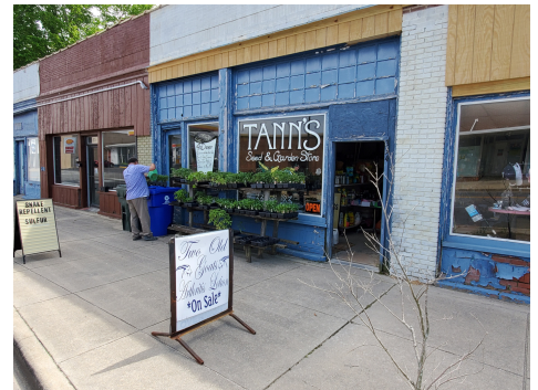
Tann's Seed & Garden Store Downtown Ahoskie