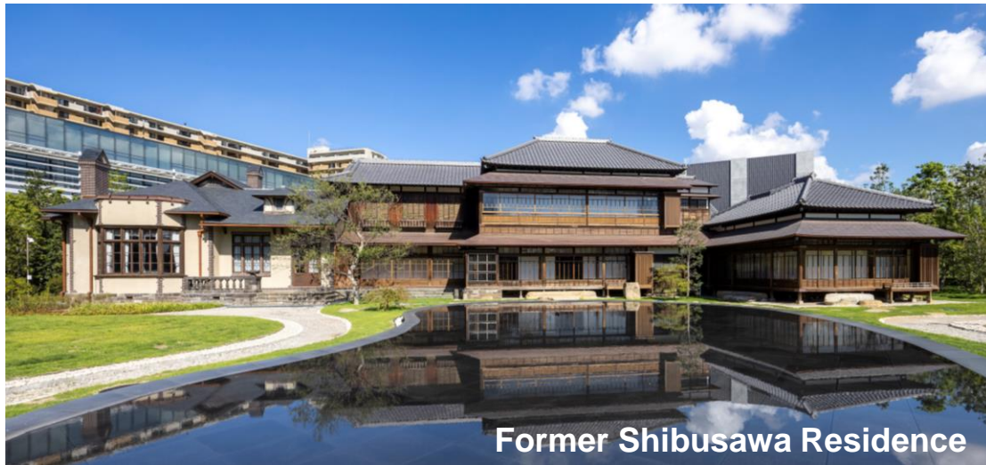
Former Shibusawa Residence