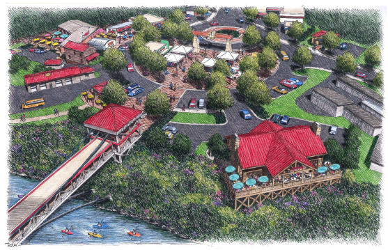
Uptown Jonesville Concept Rendering provided by the Town of Jonesville

North Carolina & Virginia Railroad Co., Inc. Headquarters in Ahoskie